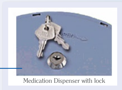
Medication Dispenser with lock

Medications can be locked away and only made available at the appropriate times throughout the day.