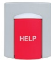
Help Button (adds safety for front door and bathroom locations)